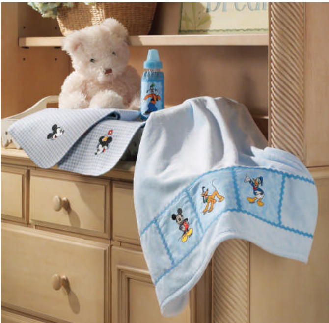
Mickey Mouse™ and Friends Baby Items