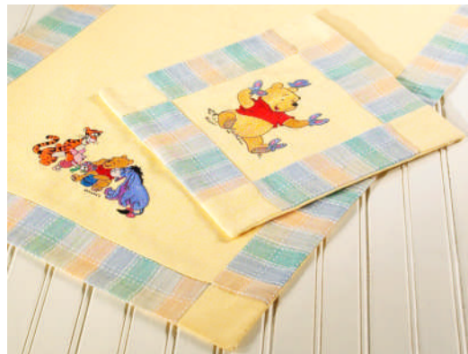
Winnie the Pooh™ Place Setting