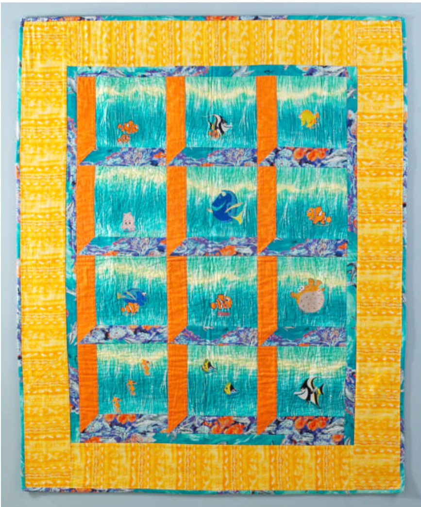
“Finding Nemo” Quilt