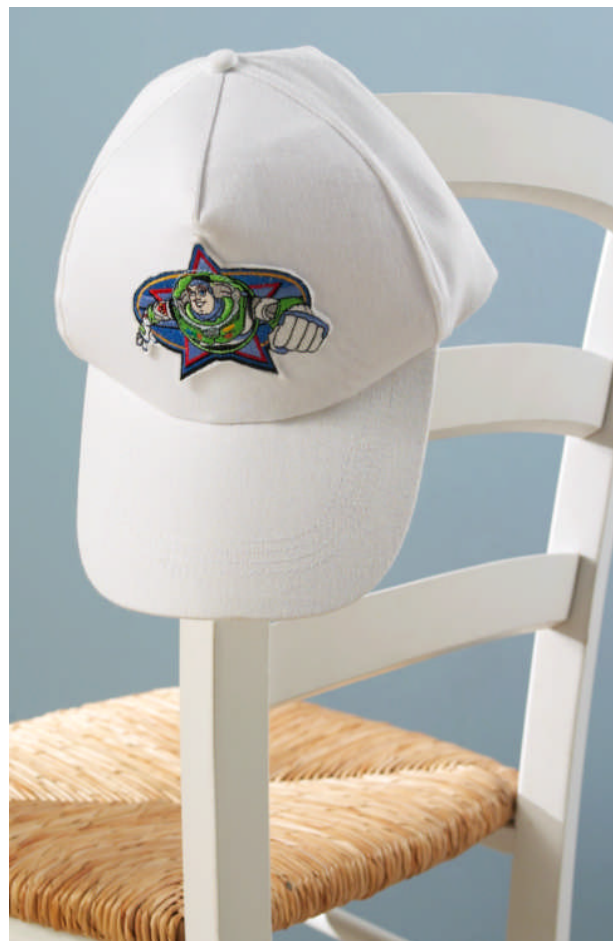
Buzz Lightyear Hat