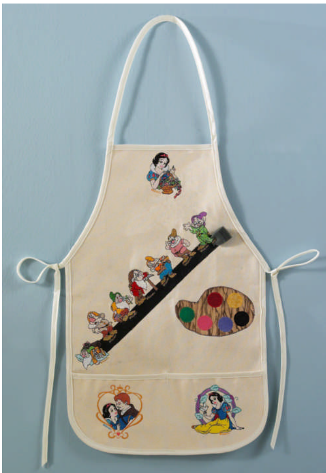
Snow White Apron