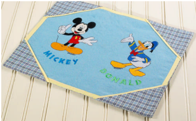
Mickey Mouse™ and Donald Duck™ Placemat