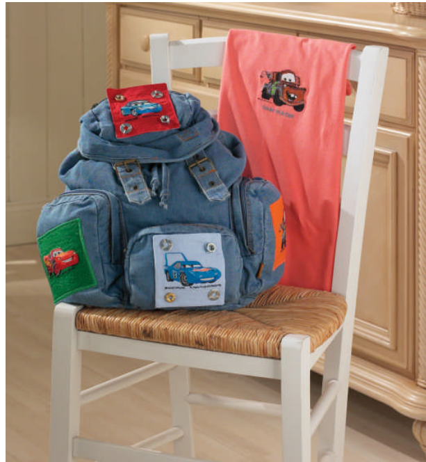
“Cars” Backpack and T-Shirt