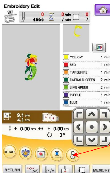
Embroidery Positioning Key