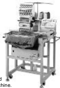
Single Head Embroidery Machine.

(Northern CA, ID, MT, NE, ND, CO, NV, SD, UT, WY) Phone: 801-270-0800 Fax: 801-912-1178 Cell: 801-556-4891