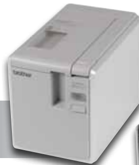
PT-9700PC (USB, Serial)

Buy 50 HG tapes and get the network-ready PT-9800PCN labeling system free*.