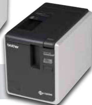
PT-9800PCN (USB, Serial, Host USB, Ethernet)

The PT-9700PC and the PT-9800PCN include everything you need to start producing your own durable, high-quality, laminated labels right away.