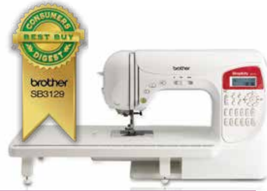
SB3129 - Simply Creative