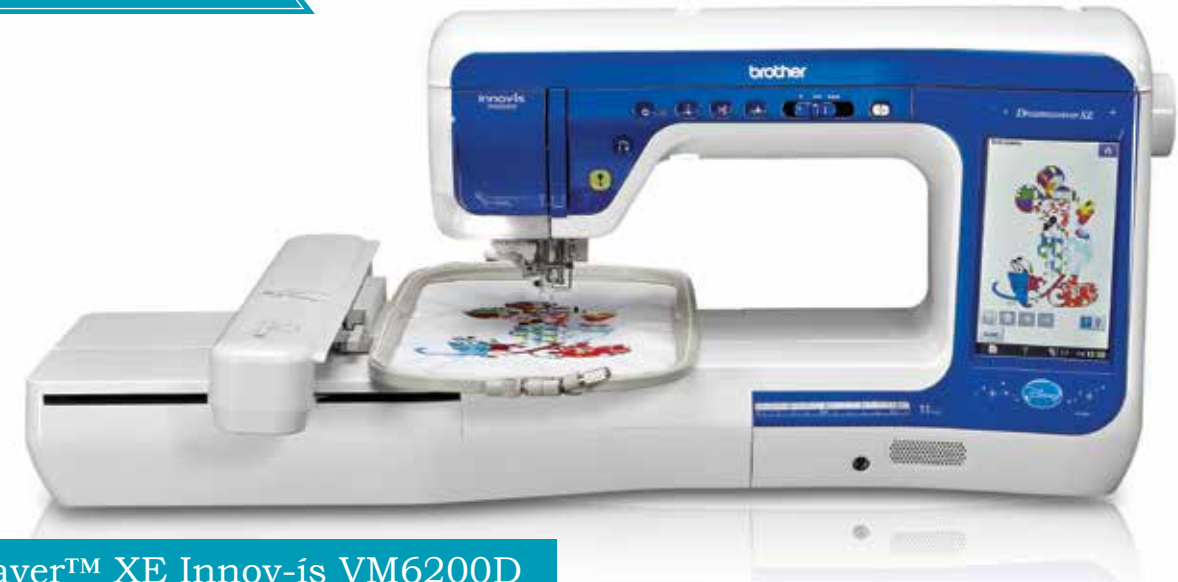
DreamWeaver™ XE Innov-is VM6200D