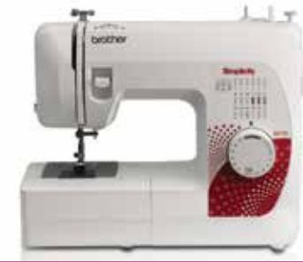
SB170 - Simply Affordable