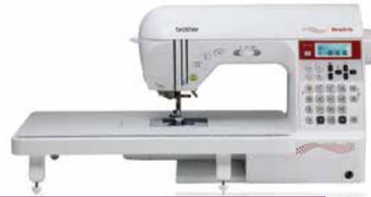
SB4138 - Simply Inspired