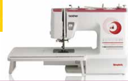
SB530T - Simply Elegant