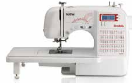
SB700T - Simply Brilliant