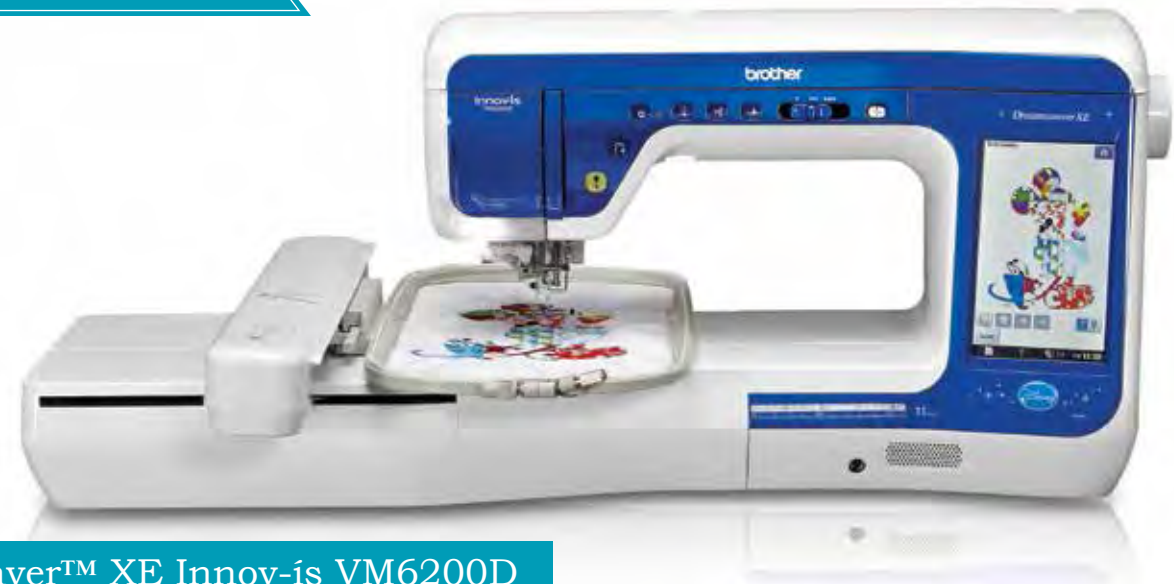
DreamWeaver™ XE Innov-is VM6200D