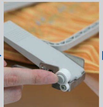
Remove the frame in one step

Makes it easy to embroider continuous designs to large pieces of cloth