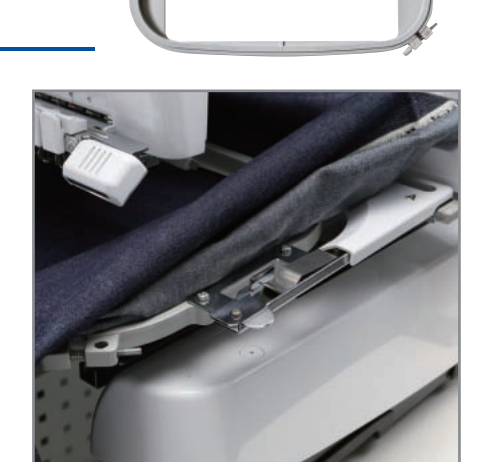
For flat frame

Cloth outside of the frame is kept on top of the frame and out of the way