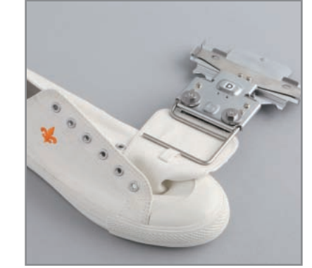
Embroider the tongues of shoes