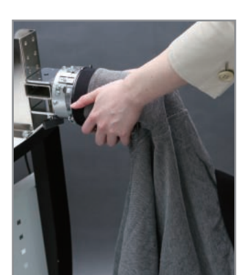
Easily stretch shirt sleeves, trousers, bags and other similar shapes

Stretch the piece over the special frame Apply embroidery just around cuffs