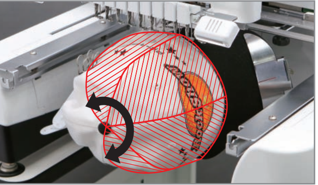
Embroider right up to the edge