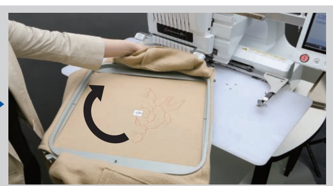
Rotate the frame when half the design is complete