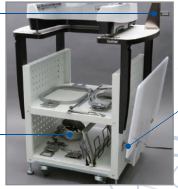
Exclusive stand with plenty of storage for various accessories