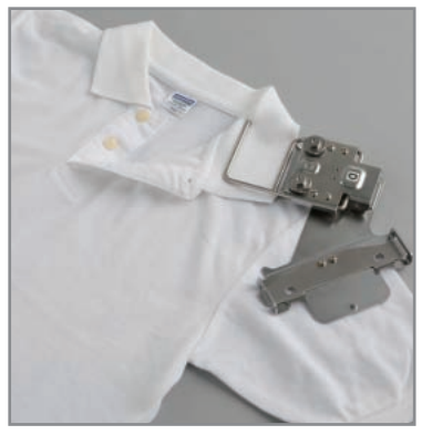
Embroider the collars of polo shirts