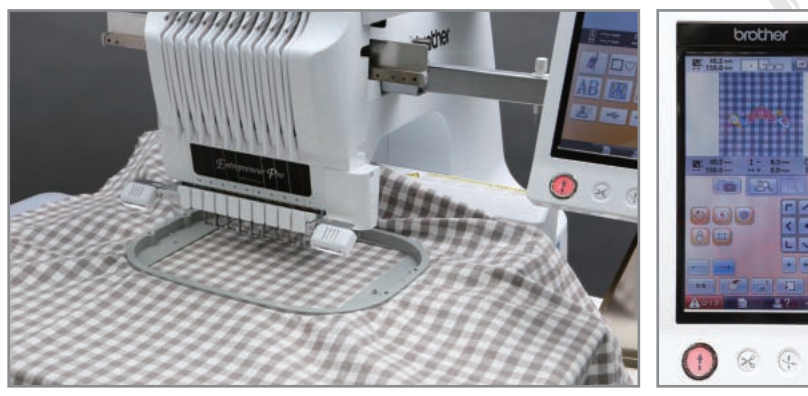
A square frame to make aligning quilt patterns and other embroidery positions