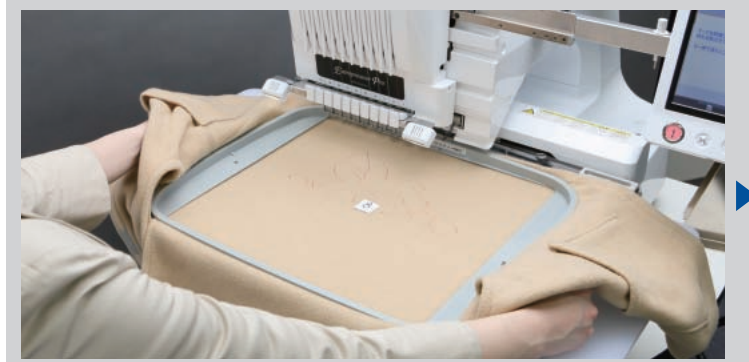
Embroider half the design with the garment stretched once