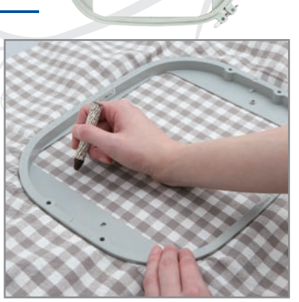
The square shape of the frame also makes it ideal for planning quilt designs