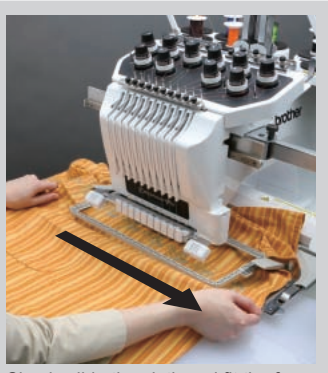
Simply slide the cloth and fit the frame

Ideal for embroidering cylindrical sections