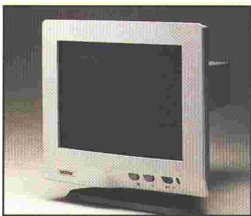
14" SUPER FLAT AMBER CRT DISPLAY Easy-to-read 20 line by 90 character high contrast glare-free screen.

Create your own professional-looking correspondence by customizing one of our 198 ready-to-use letters.