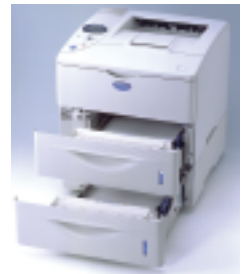
Shown with optional 2nd lower paper tray.*

Other options include an internal 802.11b/g Ethernet print server for wireless printing. The printer's memory is upgradeable from 32MB up to a maximum of 160MB* using industry-standard 100-pin DIMM modules.