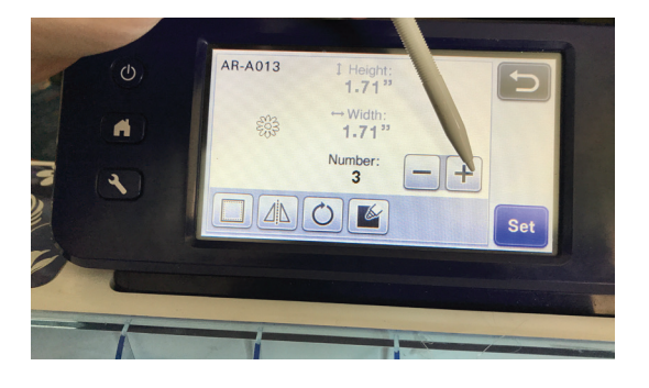
Tip : Create extra! It's always easy to put extra flowers to use, since you are creating a variety of sizes and colors. Go wild!