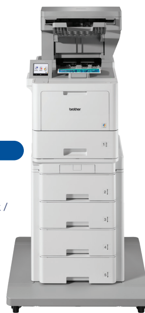
PRINTER SHOWN WITH OPTIONAL TOWER TRAY, CONNECTOR, AND STAPLER FINISHER