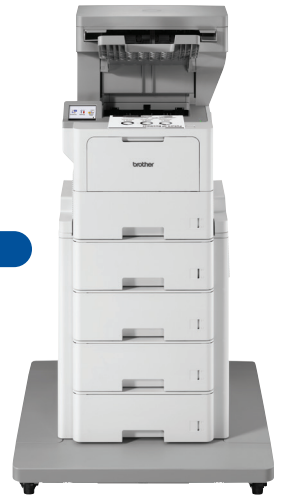
HL-L6415dw / HL-EX415dw PLUS TOWER TRAY AND STAPLER FINISHER OPTIONS