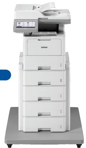
MFC-L6915dw / MFC-EX915dw ALL-IN-ONE SHOWN WITH TOWER TRAY OPTION