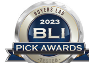
Brother HL-L9470CDN Brother HL-EX470W