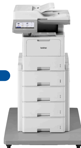
MFC-L6915dw / MFC-EX915dw ALL-IN-ONE SHOWN WITH TOWER TRAY OPTION