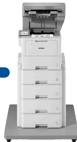
HL-L6415dw / HL-EX415dw PLUS TOWER TRAY AND STAPLER FINISHER OPTIONS