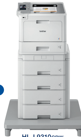
HL-L9310CDW PLUS TOWER TRAY WITH CONNECTOR OPTIONS