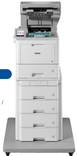
PRINTER SHOWN WITH OPTIONAL TOWER TRAY, CONNECTOR, AND STAPLER FINISHER