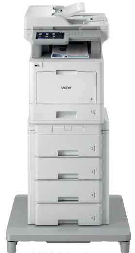
MFC-L9570CDW PLUS TOWER TRAY WITH CONNECTOR OPTIONS