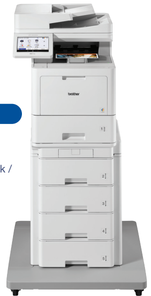
ALL-IN-ONE SHOWN WITH OPTIONAL TOWER TRAY AND CONNECTOR