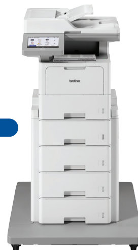
MFC-L6915dw / MFC-EX915dw ALL-IN-ONE SHOWN WITH TOWER TRAY OPTION