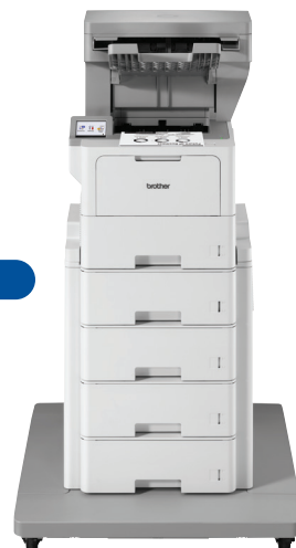
HL-L6415dw / HL-EX415dw PLUS TOWER TRAY AND STAPLER FINISHER OPTIONS