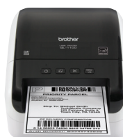
QL-820NWB / QL-820NWBc