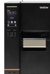
TJ-4420TN / TJ-4520TN TJ-4620TN

Up to 14" per second 20 Internal rewinder Up to 840 1-inch labels per minute 19