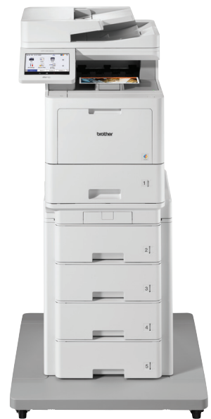
ALL-IN-ONE SHOWN WITH OPTIONAL TOWER TRAY AND CONNECTOR