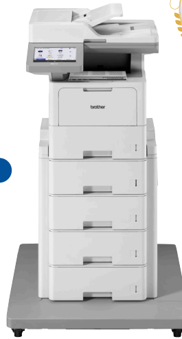
MFC-L6915dw PLUS TOWER TRAY OPTION