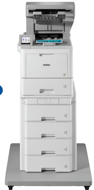
PRINTER SHOWN WITH OPTIONAL TOWER TRAY, CONNECTOR, AND STAPLER FINISHER