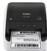
QL-820NWB / QL-820NWBc