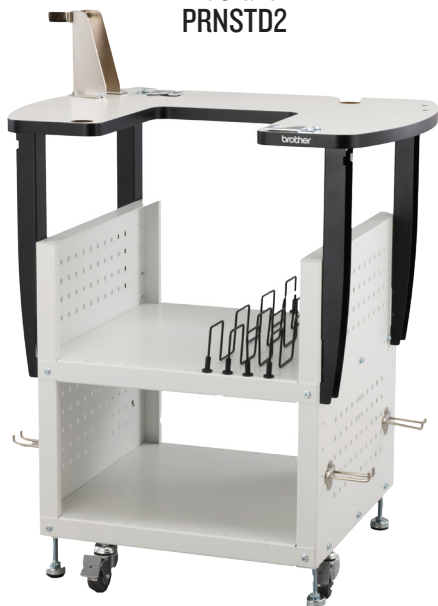
PR Stand PRNSTD2