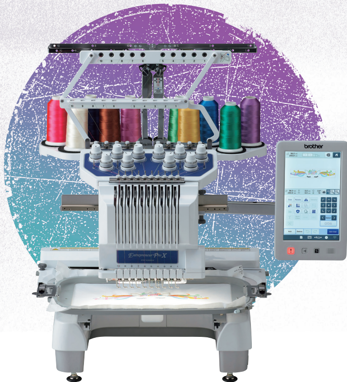
Entrepreneur Pro X PRI055X