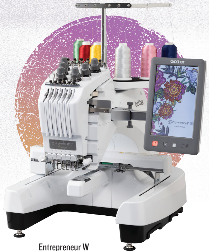
Entrepreneur W PR680W