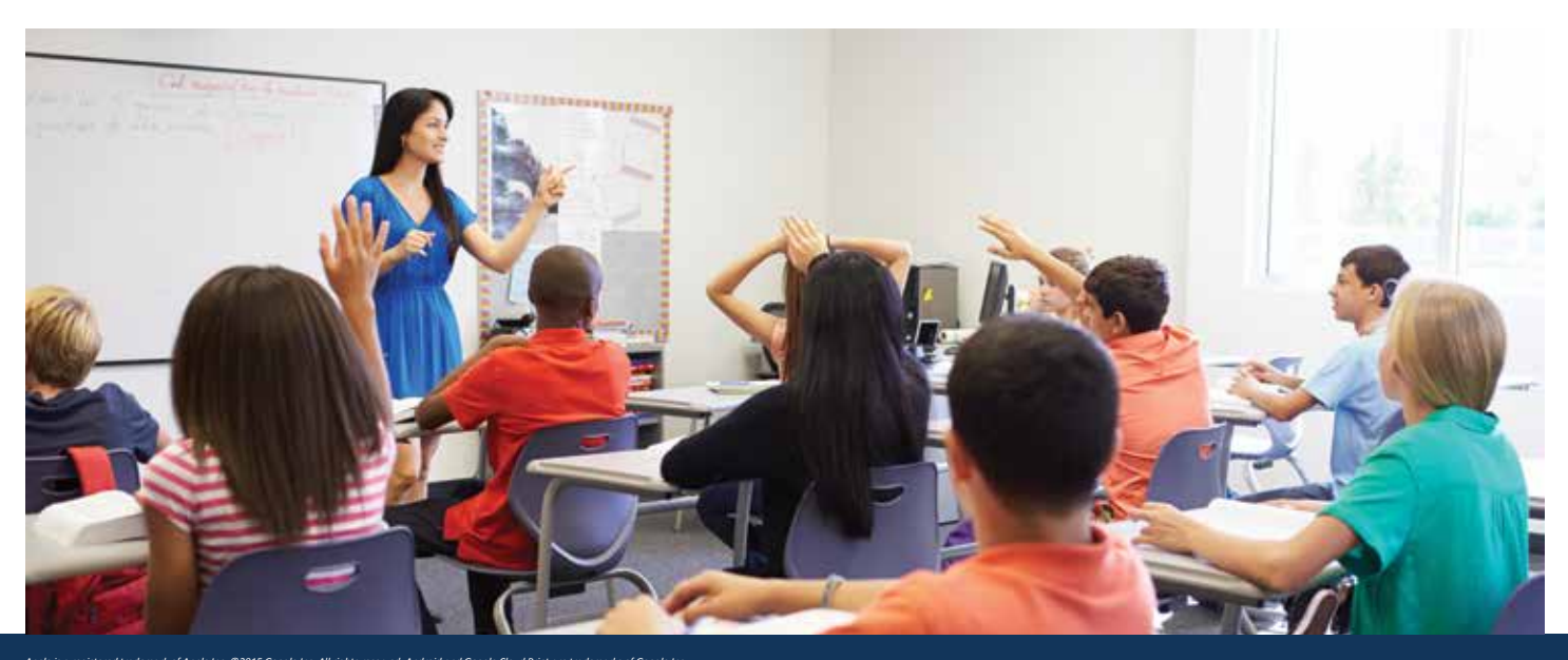
Apple is a registered trademark of Apple inc. 20215 Google inc. All rights reserved. Android and Google Cloud Pinit are trademarks of Google in All referenced trademarks and registered trademarks are the property of their respective companies. *Requires Internet connection and an account with desired service.