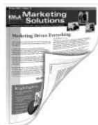
One double-sided (duplexed) sheet