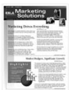
Output as 2 single sheets

The Brother MFC-8870DW also provides built-in automatic duplex (two-sided) printing, copying, scanning* and faxing. This feature can help you cut paper costs by as much as half, while giving you the ability to create professional two-sided documents for reports, proposals and other tasks, quickly and easily.