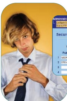
Intern Clearance: Copy only