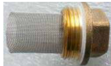
Carriage Filter alone