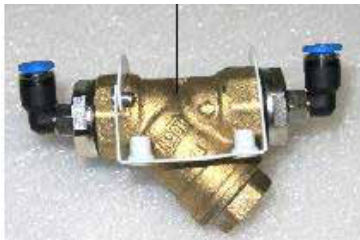
Carriage Filter System with holder