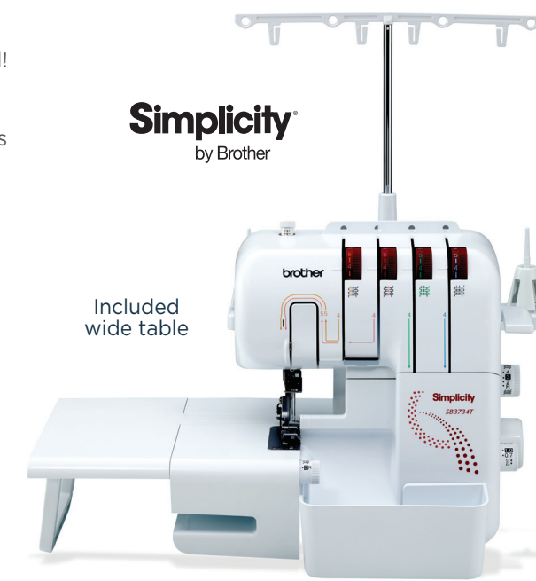
Included wide table