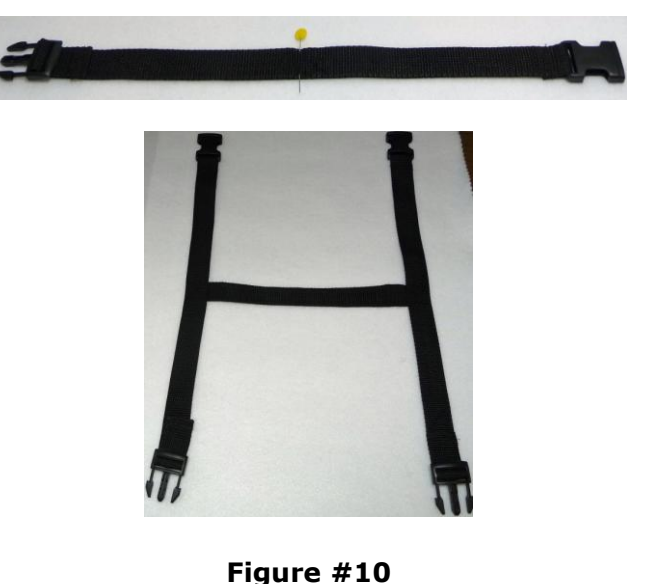
Attach strapping to blanket from here to here on both sides.