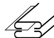
Double straight waistband style