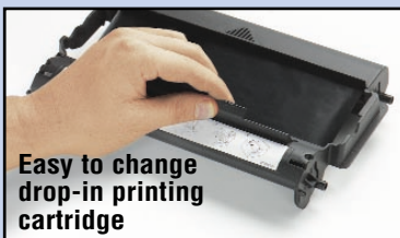
Easy to change drop-in printing cartridge