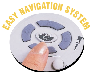
EASY NAVIGATION SYSTEM